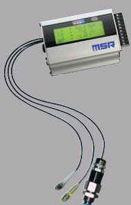
MSR255 with ext. sensors